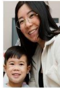
Image Description: A mom and child smiling

Let your child watch you brush your teeth to help teach them good oral health habits. A healthy smile is a happy smile! Oral health is an important part of a child's overall health.